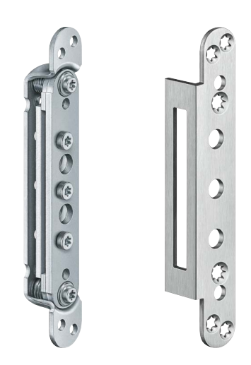
example receiver VX 7531 3D